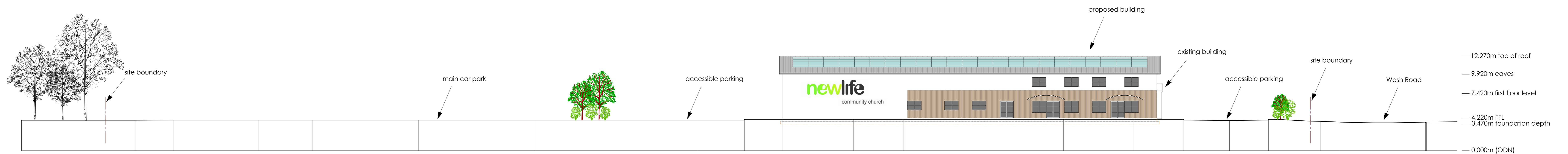
Proposed north / south site section Scale 1:200