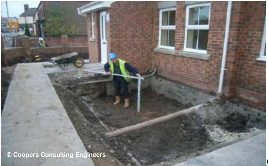
Photographs 3 & 4: Depth check of inert cover within areas of front gardens.