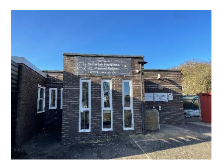
Four Field Primary School Photo

6.3 In 2021/22 £105,710.05 was received in education contributions which will be spent on the provision of an additional classroom at Four Fields Primary school in Sutterton and 5 additional places at St Thomas's Primary School, Wyberton.